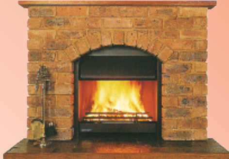
Carina 652 wood fireplace (recessed installation)