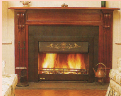
Carina 802 wood fireplace with optional decor firehood panel