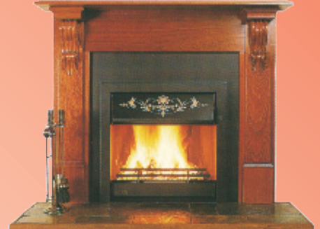
Carina 652 wood fireplace with optional decor firehood panel