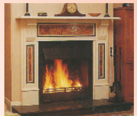
Olde Charm option 2

Olde Charm and Olde Charm Super only available in wood Olde Charm Super is a larger version of the Olde Charm