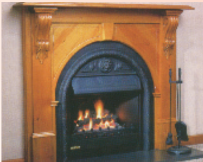
(Henty) Carina 652 gas coal fireplace