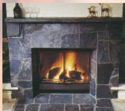
Olde Charm option 1