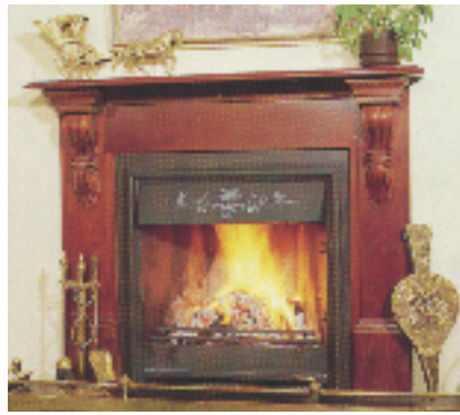
Olde Charm option 4