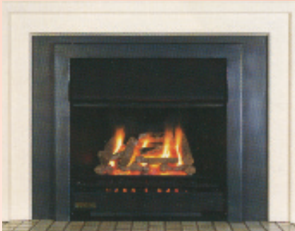
Carina 652 gas log fireplace