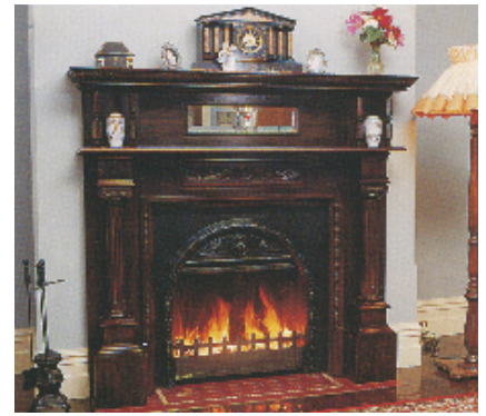
Olde Charm Henty