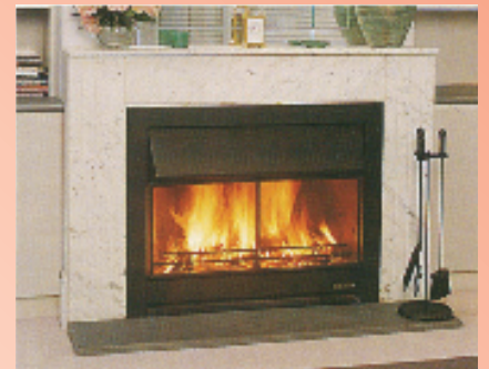
Carina 802 wood fireplace