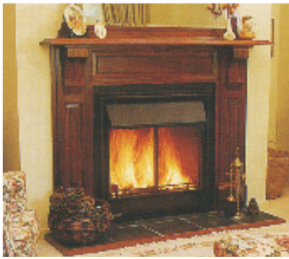
Olde Charm option 3 with optional bi-fold screen